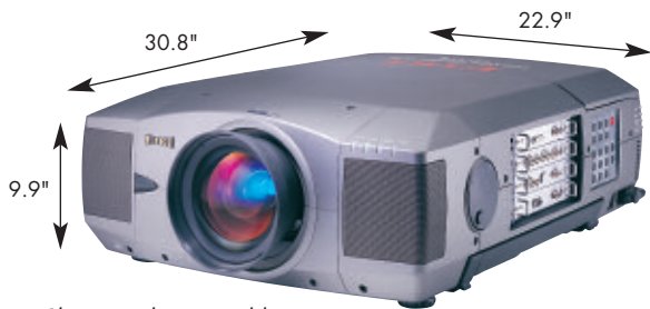
Shown with optional lens.