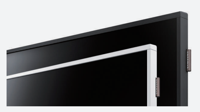
Figure 4. Various bezel types for polished professional look

This function keeps the displays functioning when issues arise by automatically switching to alternate active sources when the currently active sources go offline.