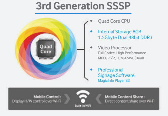
Figure 2. Robust capabilities of Samsung SMART Signage Platform (SSSP)

3rd Generation SSSP, an integrated hardware and software solution, features a media player embedded inside the display as a powerful Quad Core System on Chip (SoC). The powerful platform streamlines digital signage configuration and management by eliminating the need for an additional PC Unit. In addition, 3rd Generation SSSP features 8GB storage for flexibility and convenient, easy usage. The result is an uncluttered and simplified digital signage configuration that delivers rich, high-resolution media content smoothly, as well as enhanced operational efficiency and lower TCO.