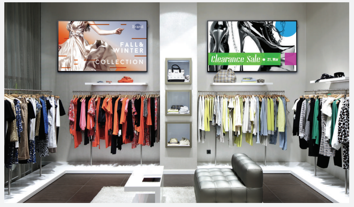
Figure 1. Samsung DHE Series SMART Signage delivers immersive and luxurious shopping experience

DHE Series displays' 24/7 robust durability delivers uninterrupted and dependable operation for consistently compelling customer messaging. Luxury retailers, malls and entertainment venues that run 24 hours a day and must provide rich messaging stand to gain the most from these continuously running displays that deliver reliable messaging while lowering costs due to less downtime and equipment maintenance.